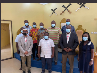
Chief and Kingsmen of the Haatso traditional area