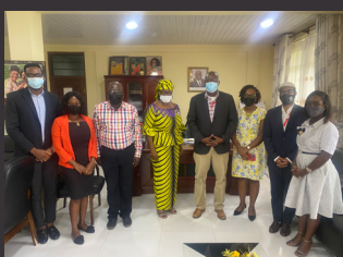
The MCE of the Ga East Municipal Assembly, Hon. Janet Tulasi Mensah