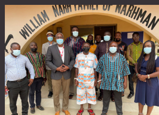
Chief and Kingsmen of the Narhman traditional area